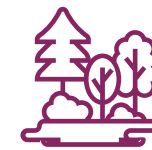
Green area with landscaping