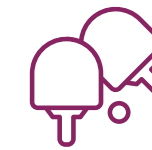
Indoor sports facilities